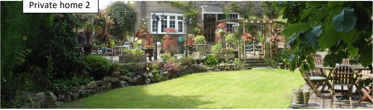
Private home 2